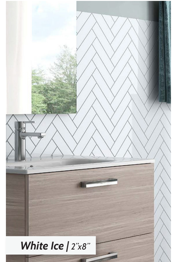
White Ice | 2"x8"