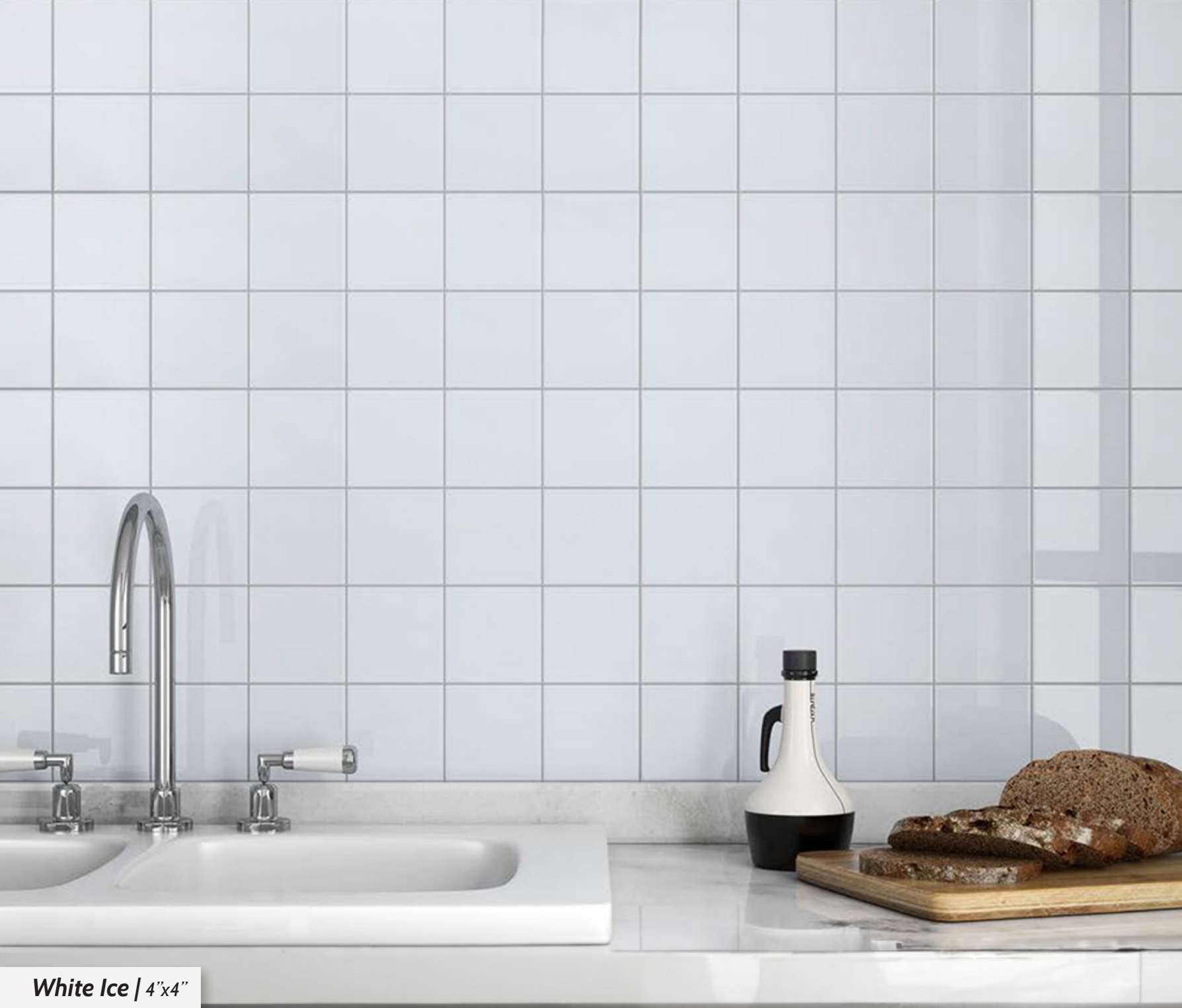
White Ice | 4"x4"